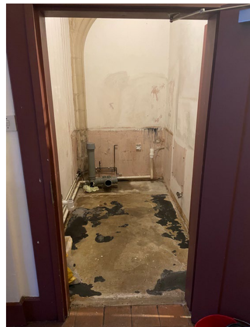
The works on the accessible toilet underway

In early 2026 we have seen the commencement of work on the roof and other external repairs to make the space wind and watertight. The disabled toilet renovations have also begun, and plans for the lounge and kitchen to be refurbished and cloister redecorated are underway. We have also had plans for a net zero heating scheme drawn up.