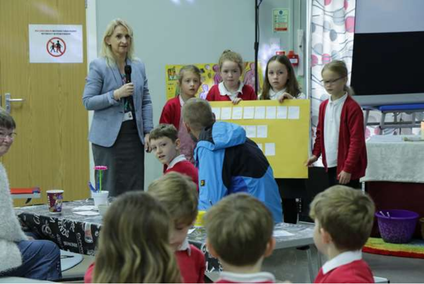
Church in School or afterschool club