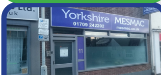
7 Health Yorkshire MESMAC