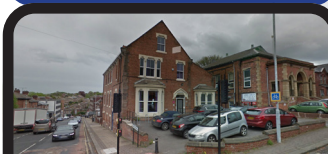
10 Alcohol & Substance Misuse CGL Rotherham