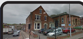
11 Alcohol & Substance Misuse DIVERT