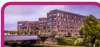
1 Housing Support Rotherham Council