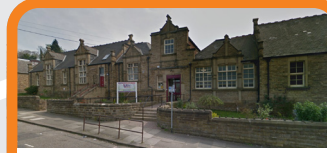
15 Food The Unity Centre. Food Bank