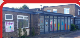
13 Drop-in Centres Shiloh Rotherham