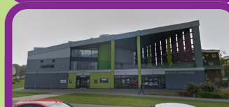
17 Asylum Seeker & Refugees British Red Cross. Support