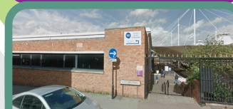
18 Advice Citizens Advice Rotherham