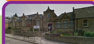
16 Asylum Seeker & Refugees REMA. Advice