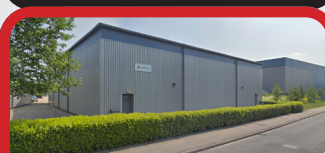
12 Drop-in Centres British Red Cross