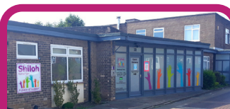
2 Drop-in Centres Shiloh Rotherham