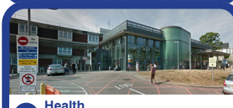
8 Health UECC (Urgent Emergency Care Centre)