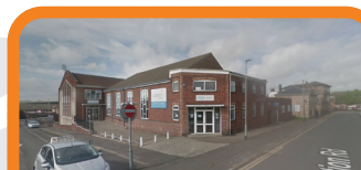
14 Food Liberty Church