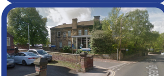
9 Health Gate Surgery