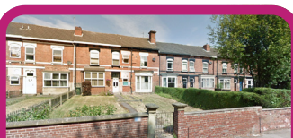
3 Housing Support Rush House Limited