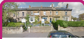
5 Housing Support Rotherham Thursday Project