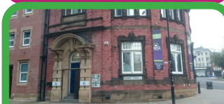
6 Abuse Rotherham Rise